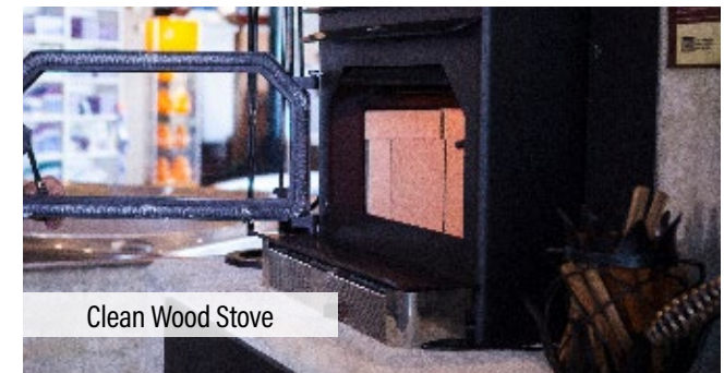
Clean Wood Stove

Register: To register your clean-burning device, visit www.valleyair.org/CBYBregistration .