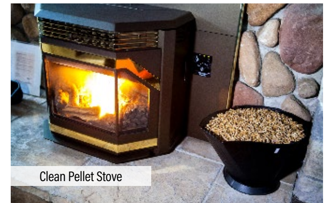
Clean Pellet Stove