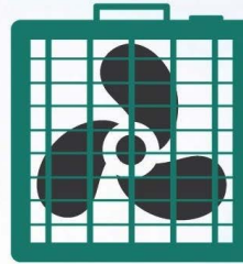
20x20 box fan