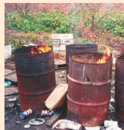
Burning anything in a burn barrel is illegal!