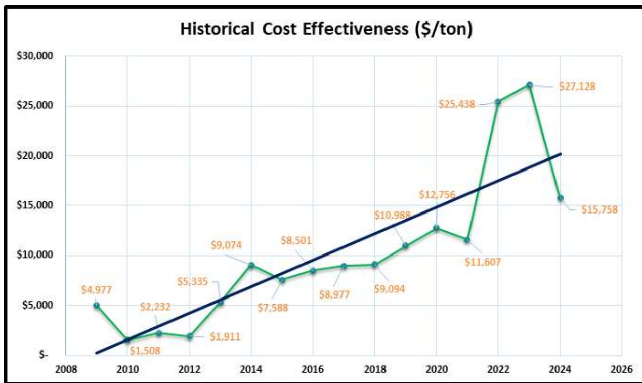
Figure 3: ISR Historical Cost Effectiveness ($/ton)

Over the history of the ISR program, the District has successfully mitigated emissions associated with projects where the project proponents have provided off-site mitigation fees; however over the past five years specifically (2019 - 2023), the Rule's current collection rate in $/ton is now below the actual $/ton achieved through the District's Grants and Incentives programs. In addition, to cover the District's cost of administering these funds, the project proponent is required to pay an administrative fee equal to four percent (4%) of the required offsite mitigation fee. This administrative fee has been in place and remained at 4% since the rule's initial adoption in 2005, and is lower than all other grant programs that the District and other air districts administer, as other administrative fees range from 6.25% - 15%.